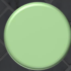
Jade Green 288