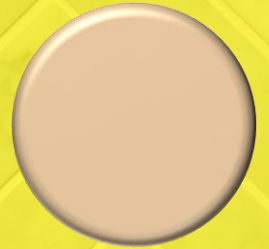
Marble Brown 210