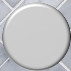
Silver Grey 58