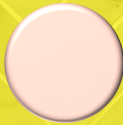
Marble Yellow 203