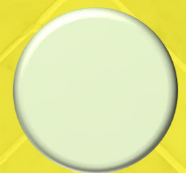
Light Green 234