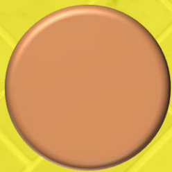
Dusky Orange 106