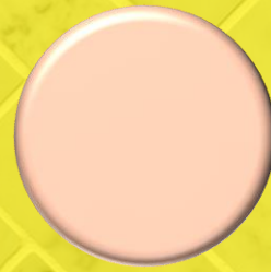
Marble Beige 212