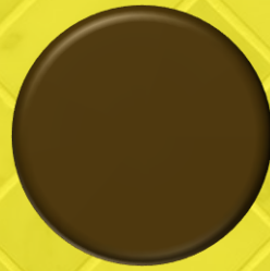
Dusky Brown 147