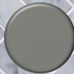
Toshiba Grey 665