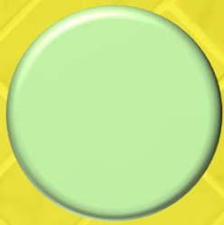
Apple Green 238