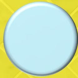
Light Blue 231