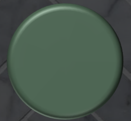
Topaz Green 228