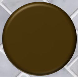
Dark Brown 80