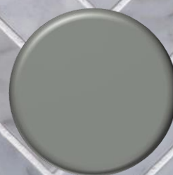
Toshiba Grey 702