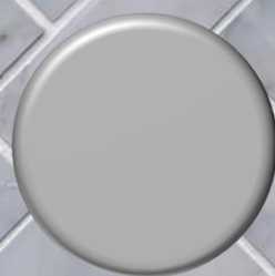
Slate Grey 64