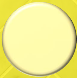
Light Yellow 110